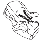
Infant seat with base