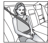
Lap/shoulder seat belt